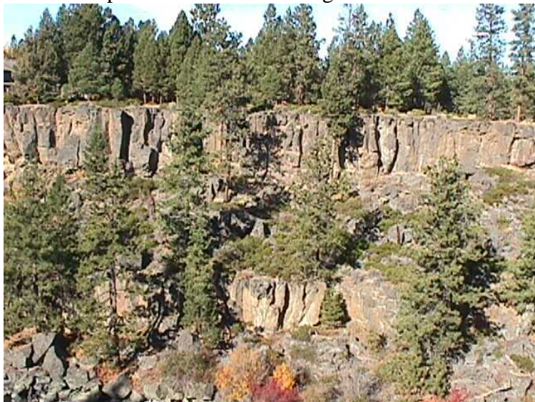
Figure 2-1 – “Area of Special Interest” lava rock outcropping

“Areas of Special Interest” are designated on the Land Use Map because they have features typical