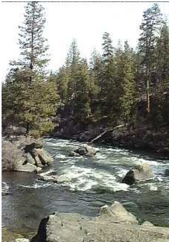
Figure 2-2 – Deschutes River, southern portion of urban area

In 1988 a statewide voters initiative added several miles of the Deschutes River to the state's scenic waterway program, including about two and one-half miles within the urban area. The area from