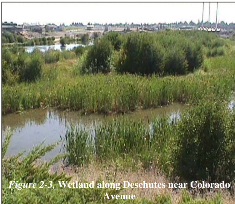
Figure 2-3, Wetland along Deschutes near Colorado Avenue

Wetlands within Bend were inventoried and evaluated in the summer of 2000 as part of the preparation of a Local Wetland Inventory, a required Periodic Review update of the General Plan. Figure 2-4 shows the significant and non-significant wetlands mapped during this Local Wetland Inventory process. Table 2-1 lists the significant wetlands. All of the significant wetland sites are along the Deschutes River. Bend's Local Wetland Inventory replaces the older National Wetlands Inventory map for the urban area.